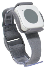
Essential+ Plan Pendant