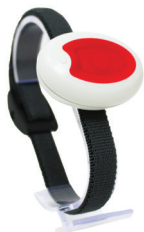
Essential Plan Pendant

You can add an additional pendant to your package as a spare or to support another user at the same address.