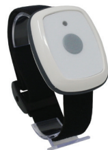
Complete Plan Pendant